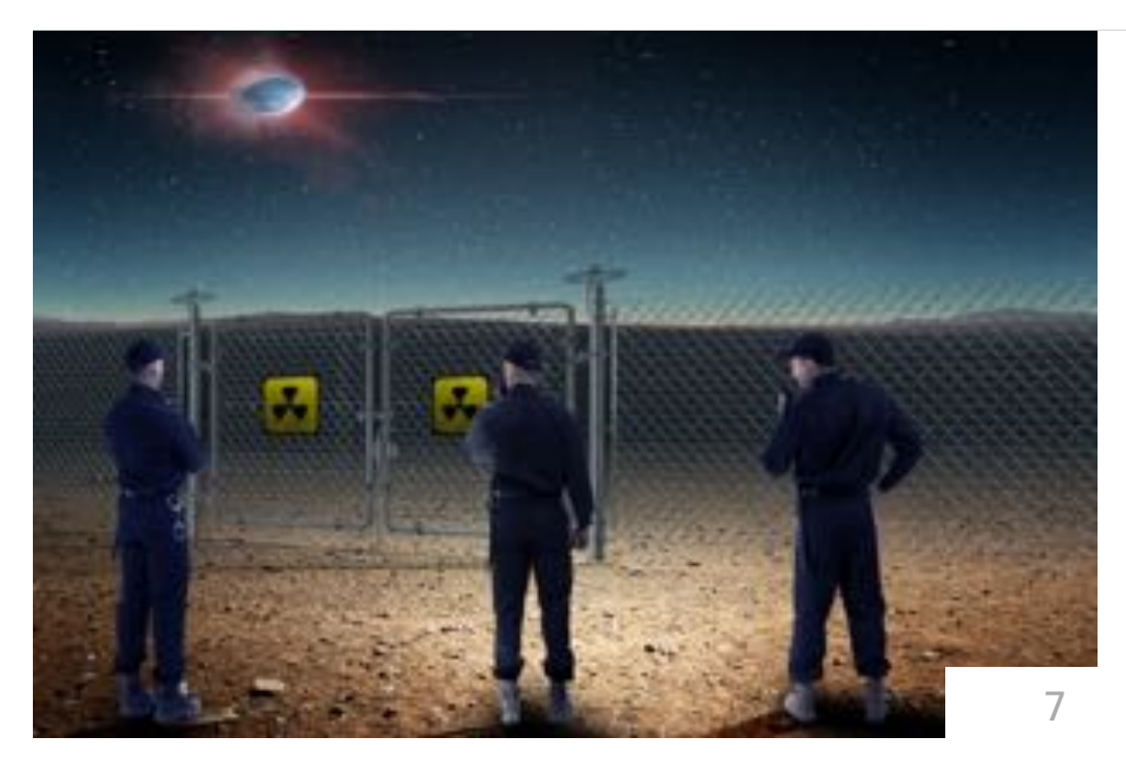
The Sun produced a mock up of the UFO as it approached the nuclear missile base