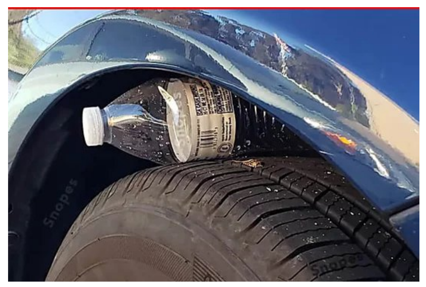
[Pics] Always Put a Plastic Bottle on Your Tires when Parked, Here's Why Journalistate