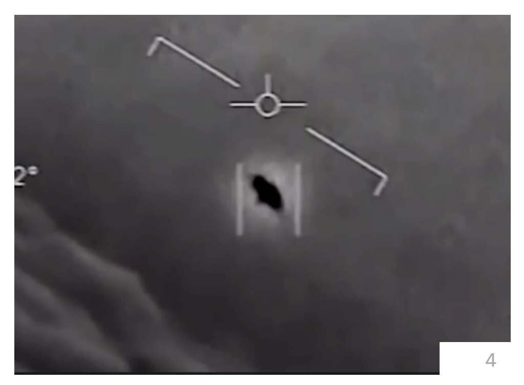
The object was briefly caught on camera

fighter pilots during a training exercise in the Pacific Ocean.