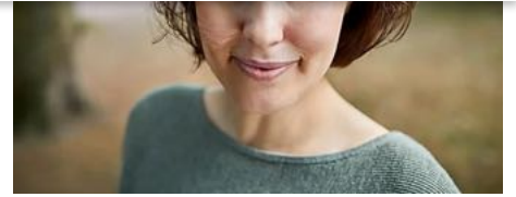
15 minuti al giorno bastano per imparare una lingua? Con questa app è possibile. Babbel