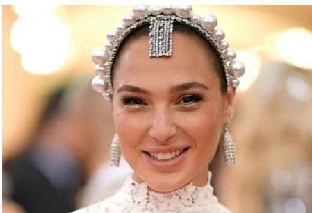
Gal Gadot's Wedding Dress Is Still Turning Heads Investing.com