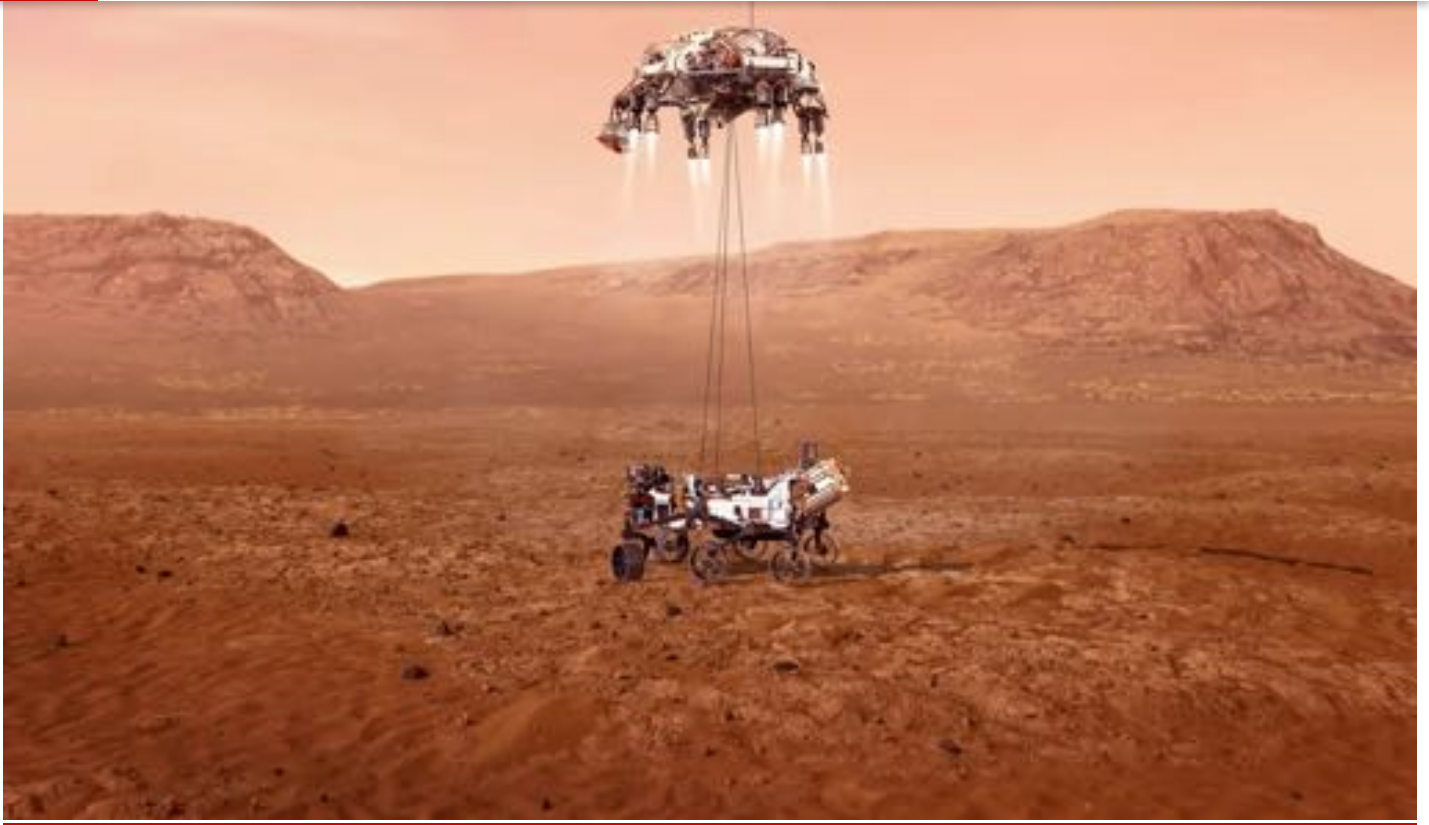
NASA has hired 24 theologians to help understand how humans will react to potential news of alien life.