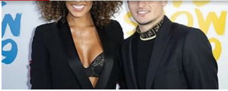
[Foto] Marco Verratti ha una moglie famosa che la maggior parte delle persone non conosce https://dadsnews.com/