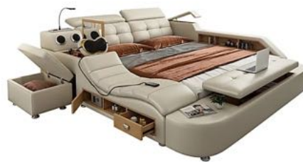
I letti intelligenti sono il futuro del riposo notturno. Clicca qui per vedere i prezzi. Letto intelligente | Ricerca Annunci