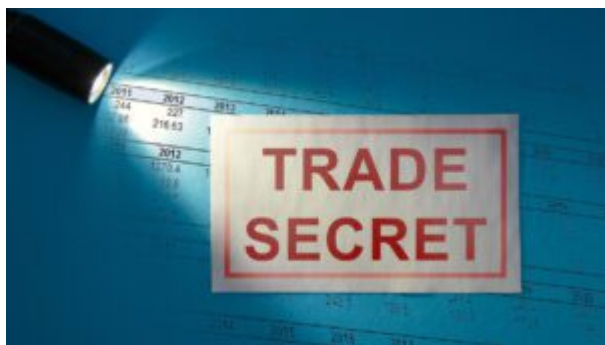
Trade Secret – inscription on a white card in the beam of light

The original CRADA will last until September of 2023, however it is unclear if the pandemic will extend the original dates due to lost time. At the termination of the agreement, the U.S. Army can not confirm whether information will be released from them, as it will rely heavily on the actual results produced.