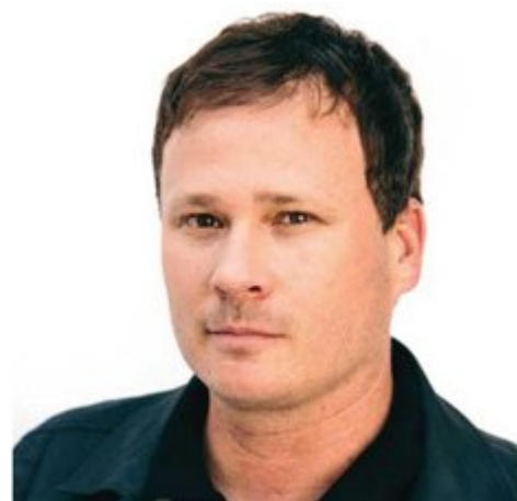
Tom DeLonge, CEO, To The Stars Academy of Arts & Science

"As announced earlier in 2019 we entered into a collaboration agreement with the U.S. Army. This was the continuation and next step of our ADAM project to analyze and advance our understanding of the collected exotic materials. The scope of the ARMY agreement covered metamaterial science, advanced communications, vehicle camouflage, and beamed energy propulsion. This contract spans five years, giving the Army access to TTSA data to support Army research. In return, TTSA gains access to scientific expertise that accelerates the quality and pace of our research. We kicked off this partnership in early 2020 with excitement, hosting the principal officers in the US Army at our headquarters in San Diego. Unfortunately, shortly thereafter the pandemic took over and all operations affiliated with our project were closed due to safety concerns or redirected to focus on other government priorities concerning the national state of emergency. As there seems to be light on the horizon to the end of the health crisis, I am confident we will have some interesting progress to report as the year progresses and the country reopens. We are dedicated to our partnership and excited to pick up where we left off as soon as we can."