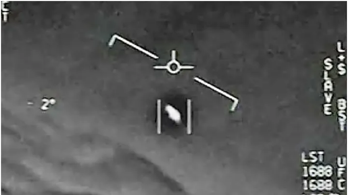
A UFO seen in a clip released by Department of Defense.

Some of the remaining uncharacterized UFO sightings "appear to have demonstrated unusual flight characteristics or performance capabilities, and require further analysis," according to the report.