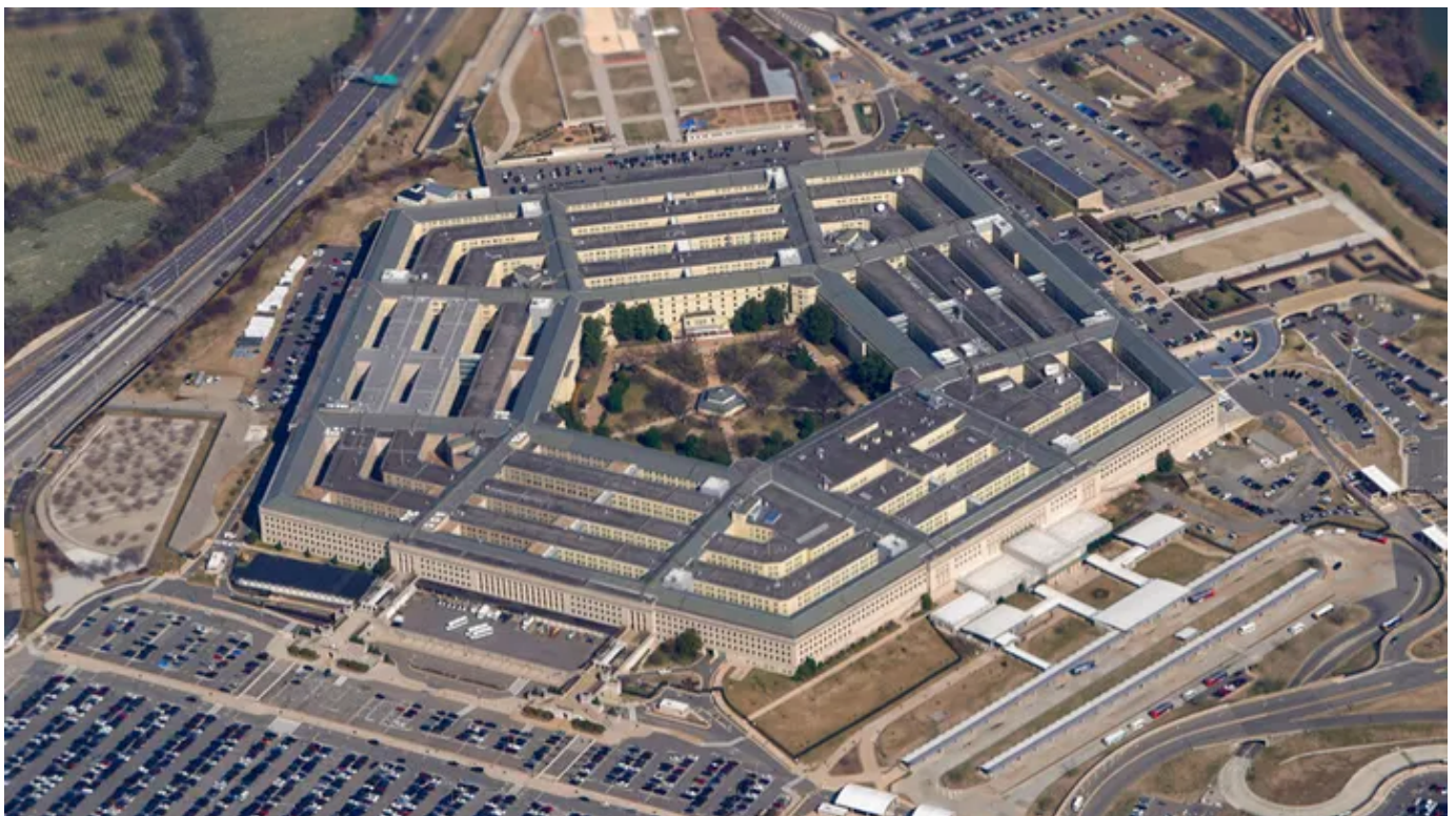
The Pentagon is seen from Air Force One as it flies over Washington, March 2, 2022.

Interest in UFOs spiked in 2021 after the DNI's preliminary assessment on UFOs, which found that some of the objects had the ability to "remain stationary in winds aloft, move against the wind, maneuver abruptly, or move at considerable speed, without discernable means of propulsion."